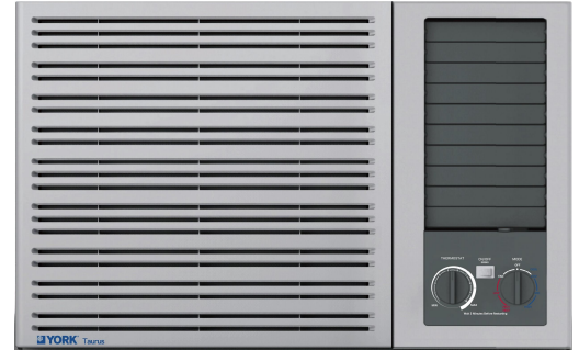
Environment Friendly R410A