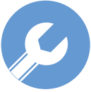
Ease of Installation