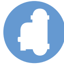
High Efficiency Protected Compressor