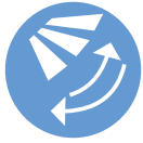
Auto Air Swing